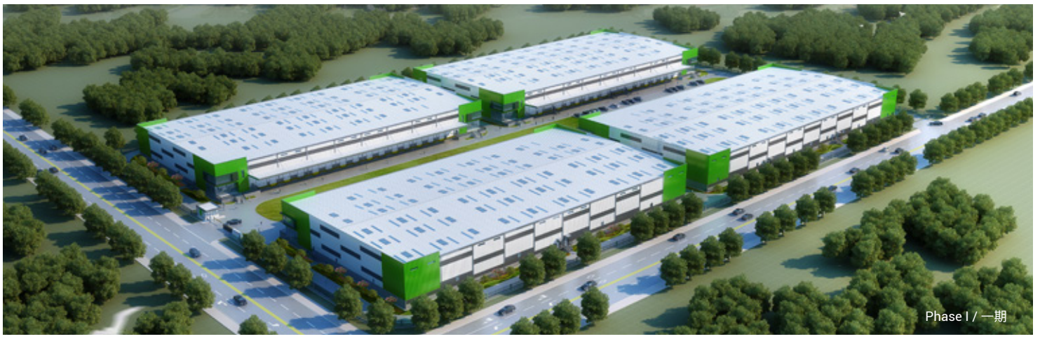
Phase I / 一期