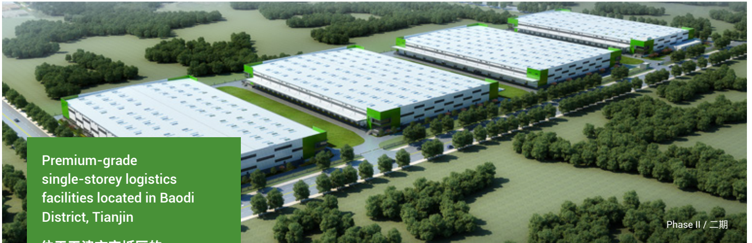
Phase II / 二期

Premium-grade single-storey logistics facilities located in Baodi District, Tianjin